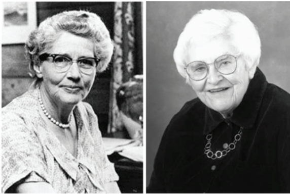
Figure 6 I am inspired by two Kober Medal recipients who went before me, Dr. Helen B. Taussig (left) and Dr. Helen M. Ranney (right).

(Figure 6). These women were true pioneers. And what’s sometimes overlooked through the rosy lens of looking backwards is that being a pioneer is really, really hard.