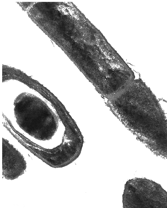
Figure 1 A spore (left) and vegetative cells and a chain of vegetative rod cells of B. anthracis .

administration of anthrax toxin to monkeys, anthrax can be considered a toxin-mediated disease.